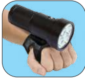
Goodman glove for hands-free operation