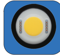
COB LED to provide 16500 lumens