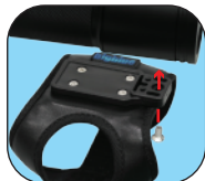
Fix the glove on the light with the supplied screw