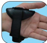
Tighten by pulling the velcro