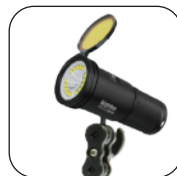
*Photographic Arms and Clips are sold separately