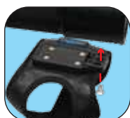
Fix the glove on the light with the supplied screw