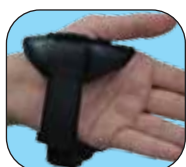
Tighten by pulling the velco