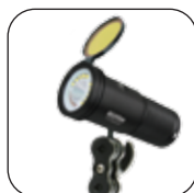
*Photographic Arms and Clips are sold separately