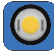
COB LED to provide 15000 lumens