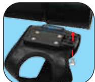
Fix the glove on the light with the supplied screw