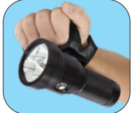
Goodman glove for hands-free operation