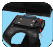
Fix the glove on the light with the supplied screw