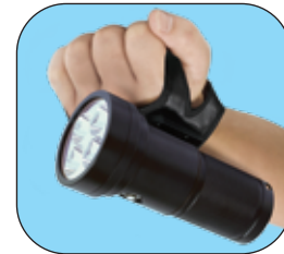
Goodman glove for hands-free operation