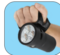
Goodman glove for hands-free operation