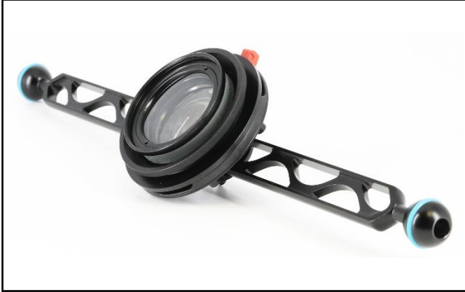
Example: CMC with bayonet adaptor on the bayonet holder.